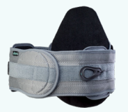
Aspen OTS™ LSO 650 Aspen OTS™ LSO 648