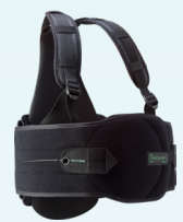
Aspen Evergreen™ 456 TLSO