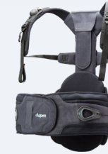
Aspen Active™ P-TLSO

Cervicogenic headaches Loss of range of motion Forward head carriage General neck pain Muscle spasms Radiculopathy Hyperkyphosis Neuropathy