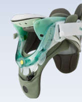
Aspen Vista™ MultiPost Therapy Collar

Postural misalignment, pain or quality of life issues