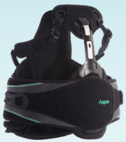
Aspen Vista™ 464 TLSO

Fracture management Structural kyphosis Spondylolisthesis Spinal stenosis Spondylosis