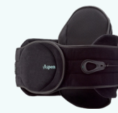
Aspen Sierra™ LSO 637