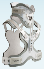
Aspen® CTO Aspen® Pediatric CTO