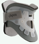
Aspen® Collar Aspen® Pediatric Collars