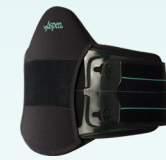
Aspen Summit™ 637 LSO Aspen Summit™ 631 LSO