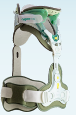
Aspen Vista™ CT04 Aspen Vista™ CTO