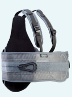
Aspen OTS™ TLSO 457