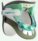
Aspen Vista™ Collar Aspen Vista™ ICU (Back Panel Only)

Sprains / strains Radiculopathy Neck pain Whiplash Trauma