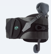
Aspen Peak Scoliosis Bracing System™