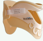
Aspen Sierra™ Universal Collar Aspen Sierra™ Pediatric Collar