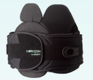
Aspen Horizon™ 639 LSO