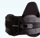
Aspen Horizon™ 637 LSO Aspen Horizon™ 631 LSO