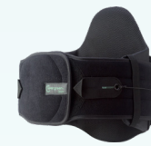
Aspen Evergreen™ 637 LSO Aspen Evergreen™ 631 LSO LoPro