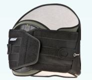
Aspen Contour™ LSO