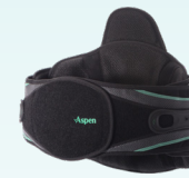
Aspen Vista™ 637 LSO Aspen Vista™ 631 LSO LoPro

Fracture management Spinal stenosis Sprains / strains Facet syndrome SI dysfunction Radiculopathy Spondylosis Sacroiliitis Injections