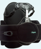
Aspen Sierra™ TLSO 464