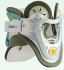
Aspen Vista™ MultiPost