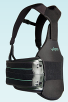
Aspen Summit™ 456 TLSO