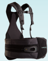
Aspen Horizon™ 456 TLSO