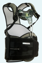
Aspen Contour™ TLSO